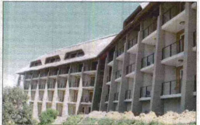
A closer view of the lodge showing some of its 60 rooms with balconies boasting panoramic views of the lake.

Vels said the lodge would also have its own house boat on Jozini Lake. "We want to drive conference and meetings to the area by targeting incentives and business tourism through things like team-building," he said.