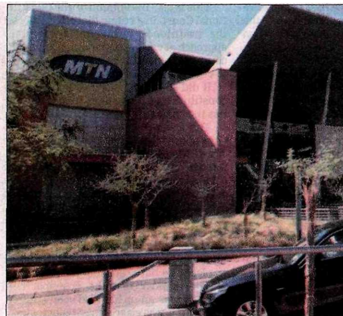
Shareholders in MTN through Asonge will get one bonus share for every 10 ordinary shares they still hold.

MTN is planning to sell about 6 percent in the listed entity to